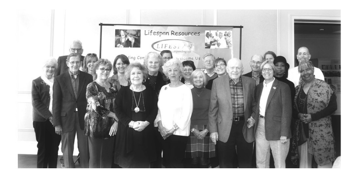
Thank you Lifespan Academy Instructors Volunteer Recognition Luncheon