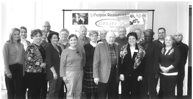
Thank you MET Drivers Volunteer Recognition Luncheon